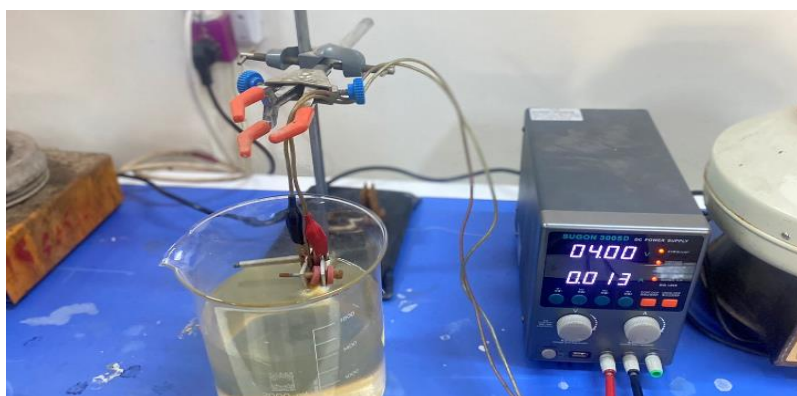
Plate1 Fenton reactor on bench scale in the lab.