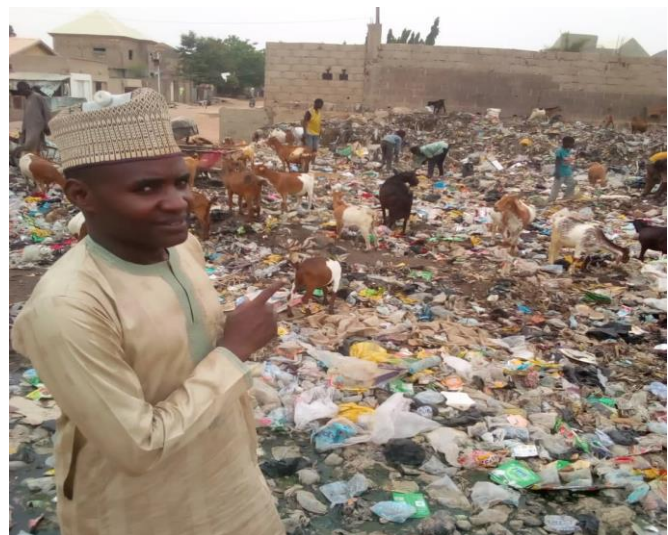
Plate 5: Environmental research student standing in an area filled with plastic waste with domestic goats searching for food waste and Leda Jari (Youths) searching for recycle plastic materials.