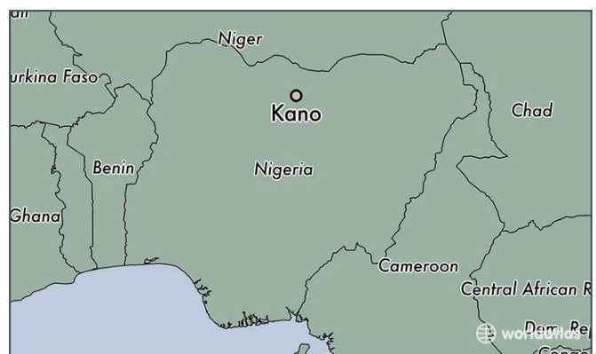
Figure 1: Map of Nigeria showing Kano province and other neighboring countries.

Kano state is situated between longitude 10° 25 N and 13° 53 N and latitude 7° 10 E and 10° 35 E, with an altitude range from 400m-800m above the sea level. Kano state is among the largest and most lively cities in Nigeria. Plastic are used in Kano for different purposes.