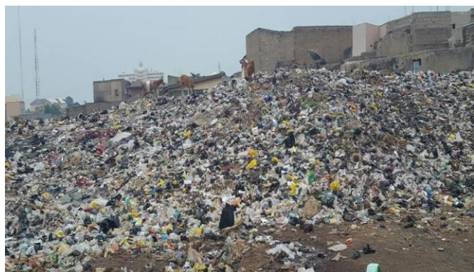
Plate 4: Vast land for residential render useless as plastics dump site at Kantudu, Dala local Government area Kano state.