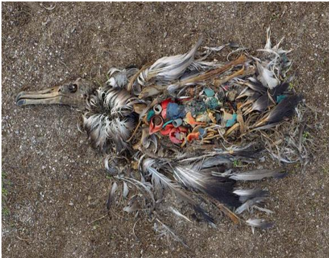
Plate 1: Displays a dead albatross bird stomach filled with plastic waste including some bottle caps it had swallowed, Source: (Jordan, 2011).