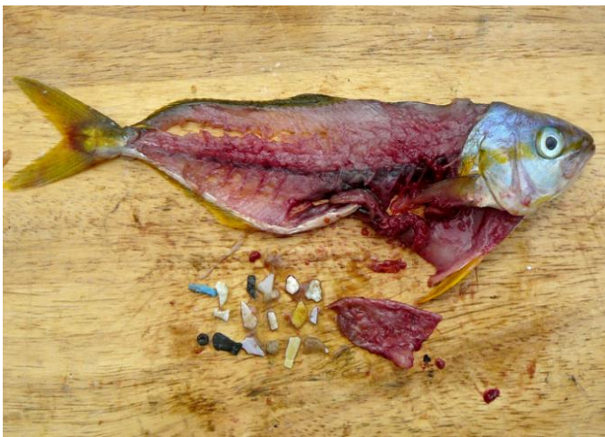
Plate 2: Plastic of different fragments found in guts of rainbow runner fish Elagatis bipinnulata after dissection.

mixed plastic garbage, such as electrical and electronic waste (Jefferson Hopewell et al., 2009). Recycling methods for plastic bags include primary, secondary, tertiary, and quaternary processing. Primary recycling, which involves mechanically reprocessing into a product with equivalent qualities, is frequently referred to as closed-loop recycling. Secondary recycling, sometimes called downgrading, is the mechanical treatment of materials to create goods with less desirable qualities. When the polymer is broken down into its chemical components, tertiary recycling—also referred to as feedstock or chemical recycling—occurs (Fisher, 2003). Energy recovery, energy from garbage, or value-adding is quaternary recycling. Composting biodegradable plastics is an additional example of tertiary recycling. This recycling might be categorized as biological or organic (Song et al., 2009).