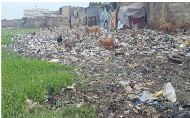
Plate 3: Roaming goats searching for food waste within widespread of plastic materials.

Below are some photos to support the plastic proliferations in Kano Metropolitan, Nigeria